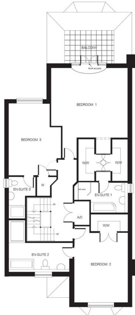
PLOT 1 - FIRST FLOOR