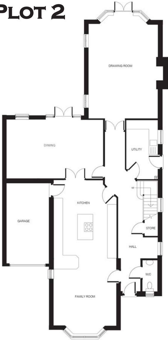
PLOT 2 - GROUND FLOOR