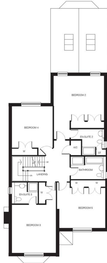
PLOT 3 - FIRST FLOOR