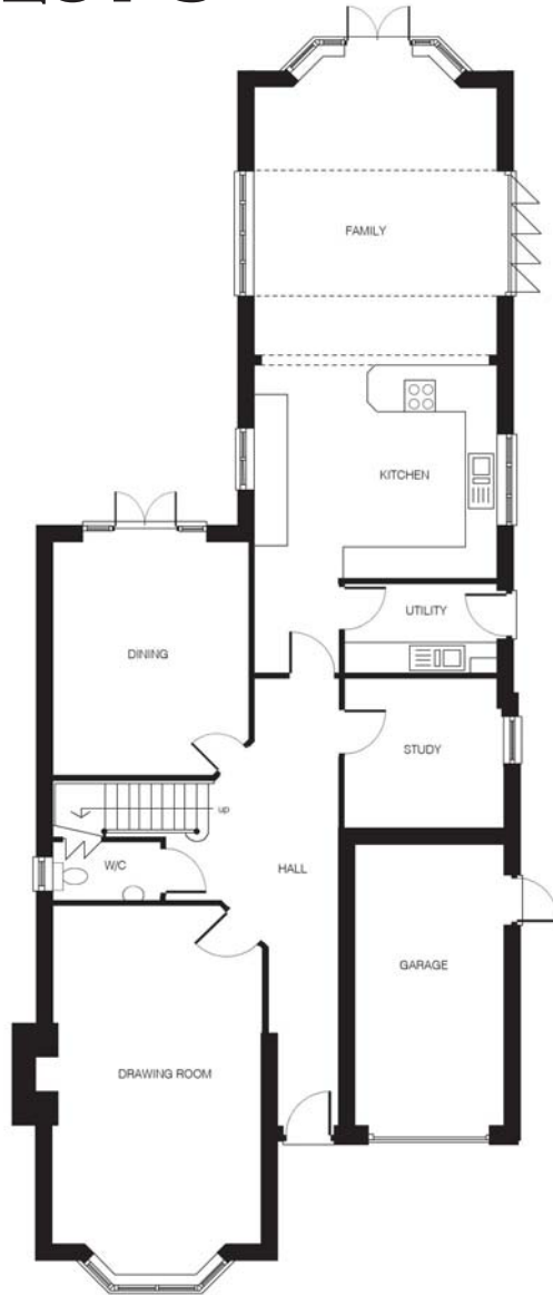
PLOT 3 - GROUND FLOOR